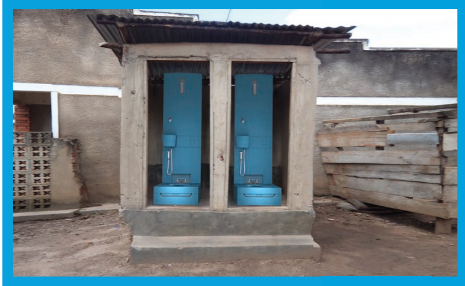
Photomontage of a retrofitted superstructure

To support the "rent a toilet" concept, the toilet unit has been developed as a mobile furniture piece with ultra-compact measurements to fit in existing superstructures.