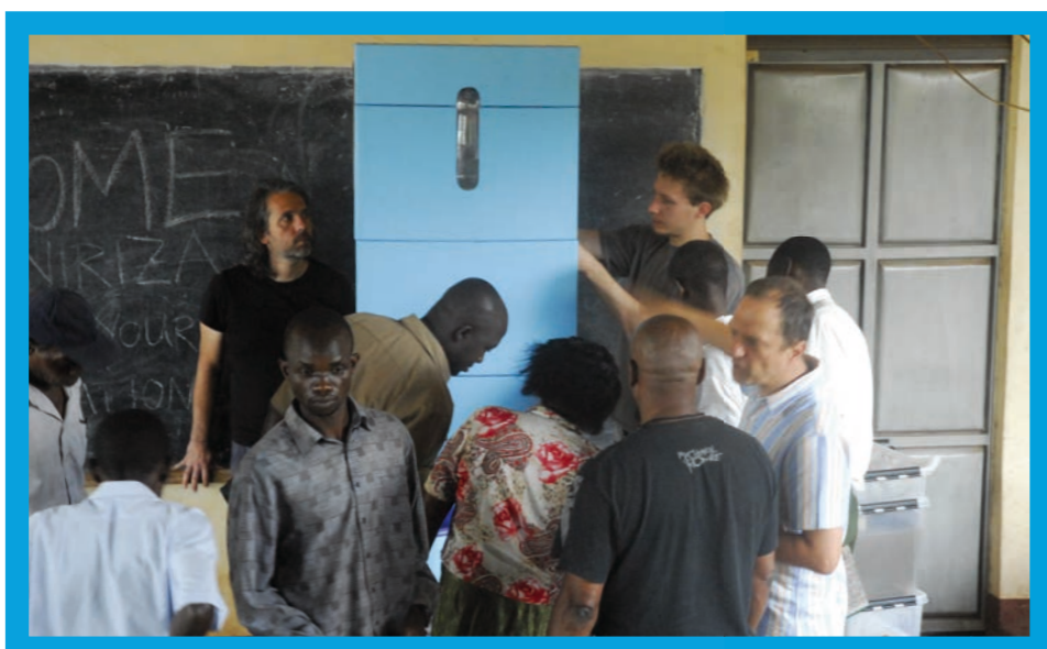
Co-creation workshop in Kampala (Uganda)

The design team presented a full scale design model to discuss product appearance and functionality. Local manufacturing (e.g. rotational moulding) and the availability of parts have been checked.