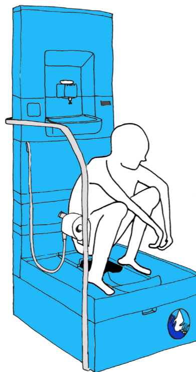
3. Do „your business“ in a way that faeces and urine are separated