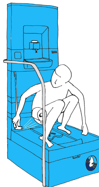
4. Use the handshower if you like. The lid to the faeces opening closes automatically